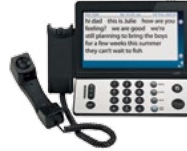
Touch Screen Captioned Phone