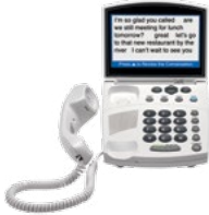
Standard Captioned Phone

Either way, you'll understand every word of your conversation.